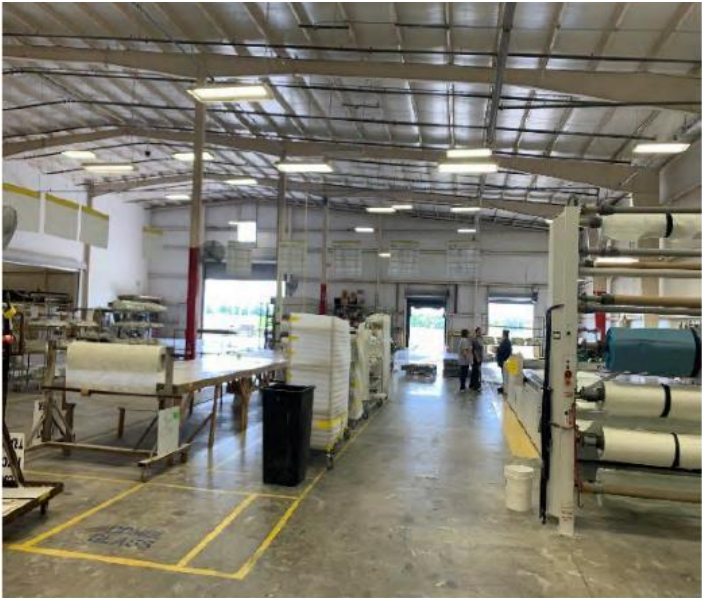
SHOP LOOKING SOUTH